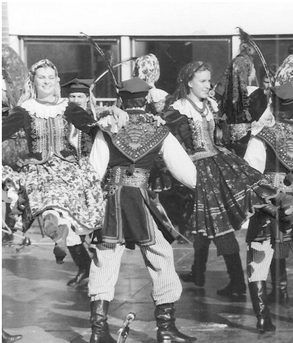
A picture of Polish dancers (this photo was taken in Billingham by Judith Payling in the 80s) to complement the drawings in this issue of similar costumes.