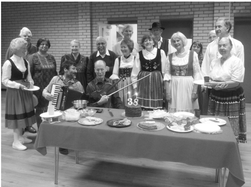
Rainmakers 38th Anniversary Dance - see article in December issue